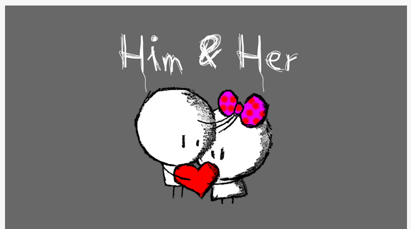
Him & Her cover image

And there is something different about this game. It was developed by the indie companies