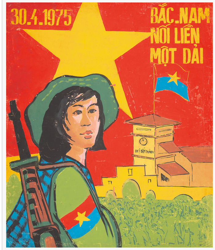
Kho, North and South We Are One. 1975. Est: $3,000-$4,000.

As always, transport posters for bicycles, aviation, and automobiles are featured. Highlights include Penfield's ca. 1900 The Northampton Cycle Co. (est. $12,000-$15,000), Livemont's 1902 Automobile Club de France / 5me Salon (est. $6,000-$7,000), Bellery-Desfontaines 1905 Automobiles Georges Richard (est. $12,000-$14,000), Mazza's 1910