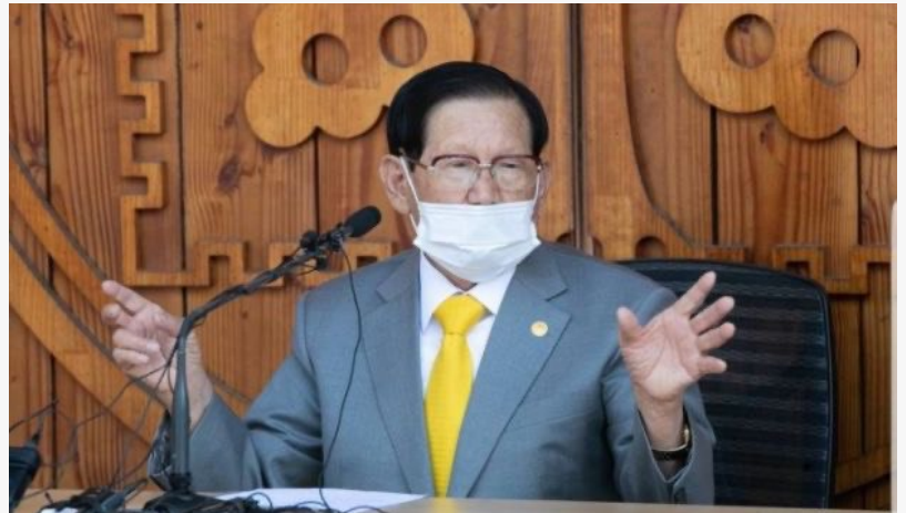
Shincheonji Chairman Man Hee Lee

WASHINGTON D.C., UNITED STATES, June 30, 2020 /EINPresswire.com/ -- Man Hee Lee, Chairman and Founder of Shincheonji Church of Jesus, the Temple of the Tabernacle of the Testimony (Shincheonji) expressed his gratitude to his church members and the city of Daegu after 4000 congregants volunteered to donate plasma after fully recovering from COVID-19.