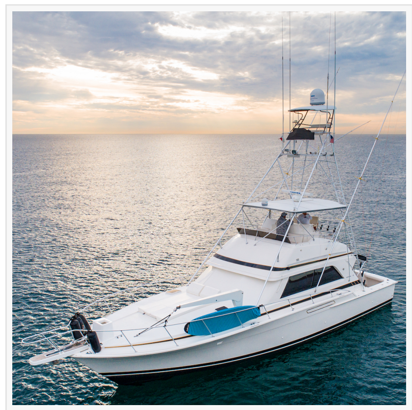
Fishing in Cabo San Lucas

Fishing requires patience. To keep people entertained during those bouts of peace, Tag Cabo has equipped the yacht with water equipment for nonfishing activities. The yacht comes with kayaks, snorkeling gear, a paddle board and more to give passengers something to do if they need a break from fishing.