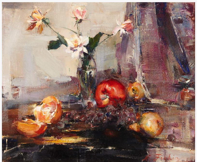
Oil on canvas painting by Nicolai Fechin (Russian, 1881-1955), titled Still life with flowers and fruit, circa 1925, 20 inches by 24 inches (est. $70,000-$100,000).