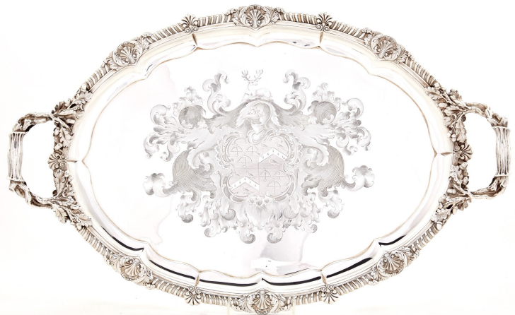
One of a pair Regency sterling silver two handled footed trays by Paul Storr, (London, 1814), centrally engraved with a heraldic crest above an elaborate coat-of-arms within a scrolled surround, weight approximately 170oz troy (est. $5,000-$7,000).