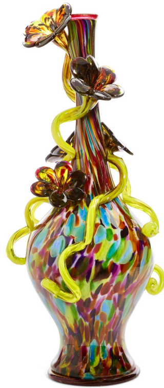
Dale Chihuly blown and applied glass 'Venetian' vase, 1996, 32 ½ inches tall (est. $8,000-$12,000).