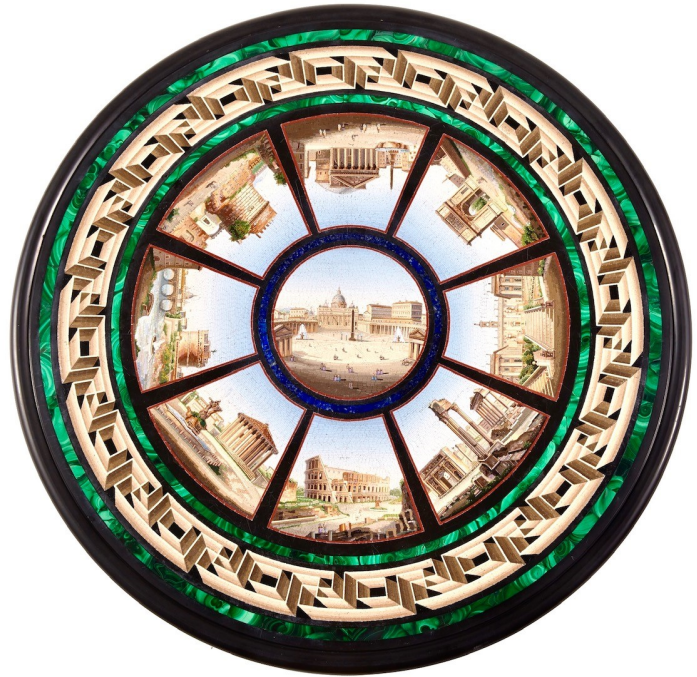
Fine Italian micro mosaic table top, circa second half 19th century, diameter of top 22 inches (est. $20,000-$30,000).

The Silvers developed a love of the intricacies and subtleties of the art of Italian micro mosaics