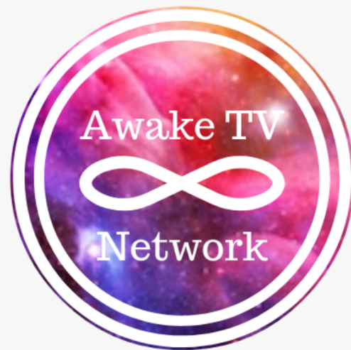
Awake TV Network