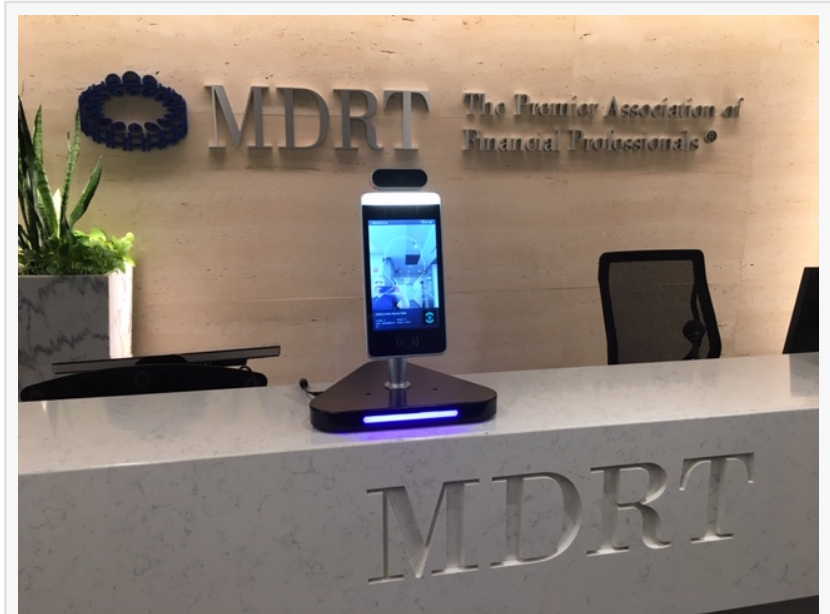
LamasaTech's temperature check kiosk at MDRT's reception.

LamasaTech's automatic non-contact kiosk allows the customised configuration of an acceptable temperature threshold, as well as its integrated placement in gates, turnstiles and doors; this way, the employer is assured to have absolute and definitive control over access. In addition,