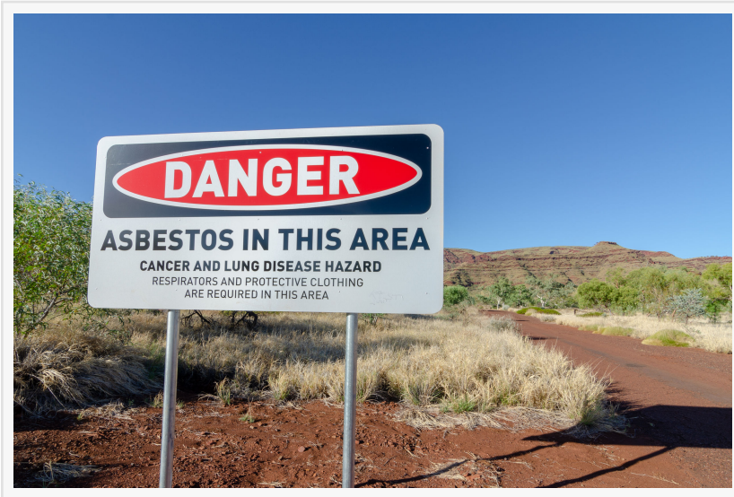
The asbestos industry knowingly poisoned people for decades.

States with the highest incidence of mesothelioma include Oregon, Washington, Louisiana, Minnesota, North Dakota, Michigan, Illinois, Virginia, West Virginia, Ohio, Pennsylvania, New Jersey, Maryland, Massachusetts, Maine and