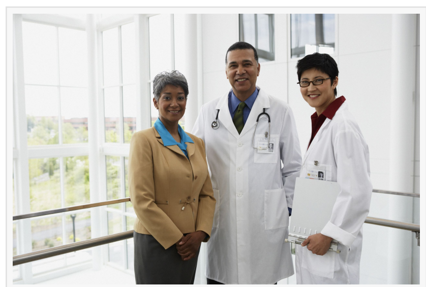
The Steinberg Law Group is affiliated with doctors around the country.