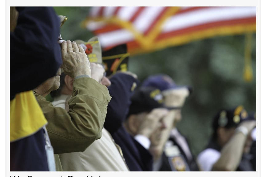
We Support Our Veterans

Connecticut. For more information about mesothelioma and asbestos-related lung cancer, call (888) 891-2200 or visit <a href="www.mesotheliomaoptions.com">www.mesotheliomaoptions.com</a>.