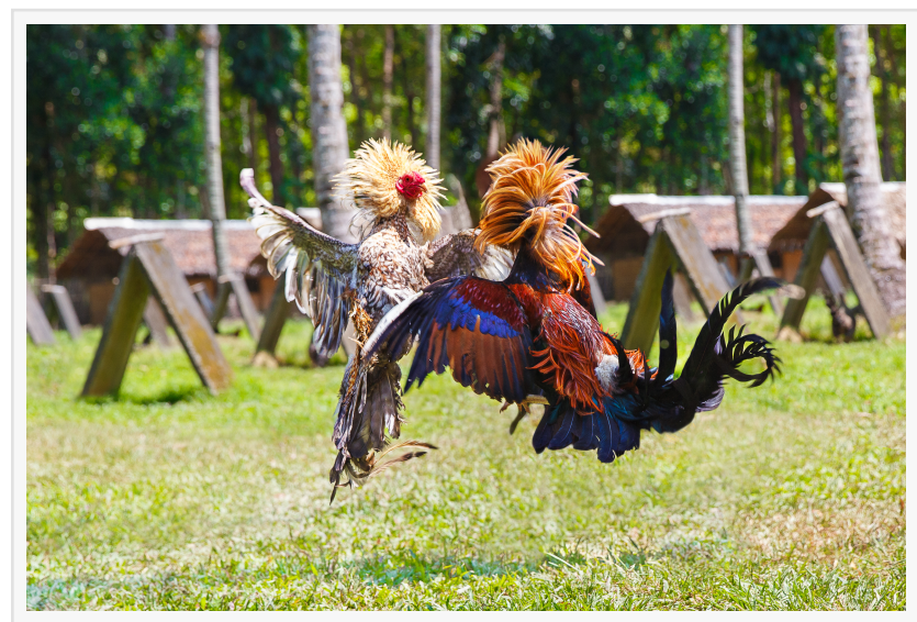
Cockfighting that runs rampant in Tennessee