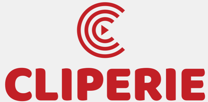
Video linkage platform Cliperie.com

Cliperie.com enables the simplicity of usage via automation of underlying technologies. The native support of the latest web standards allows seamless access to the platform from the most popular HTML5-enabled browsers on mobile phones, tablets and personal computers.