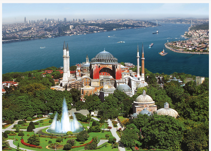
Hagia Sophia Museum not Mosque

President Recep Tayyip Erdoğan is considering converting the Hagia Sophia to a Mosque, which has been a museum since its conquest. As Muslims, we appeal to President Erdogan to keep it as a Museum, and not convert it to a Mosque.