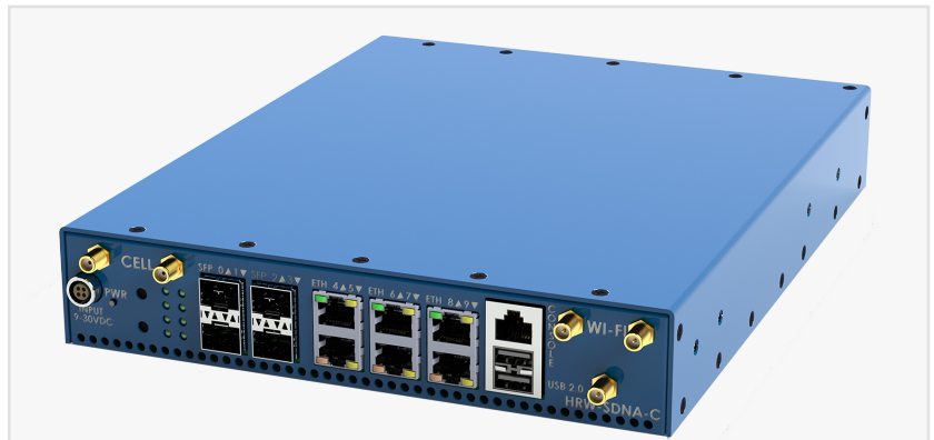
Sub U Systems Software Definable Network Appliance™