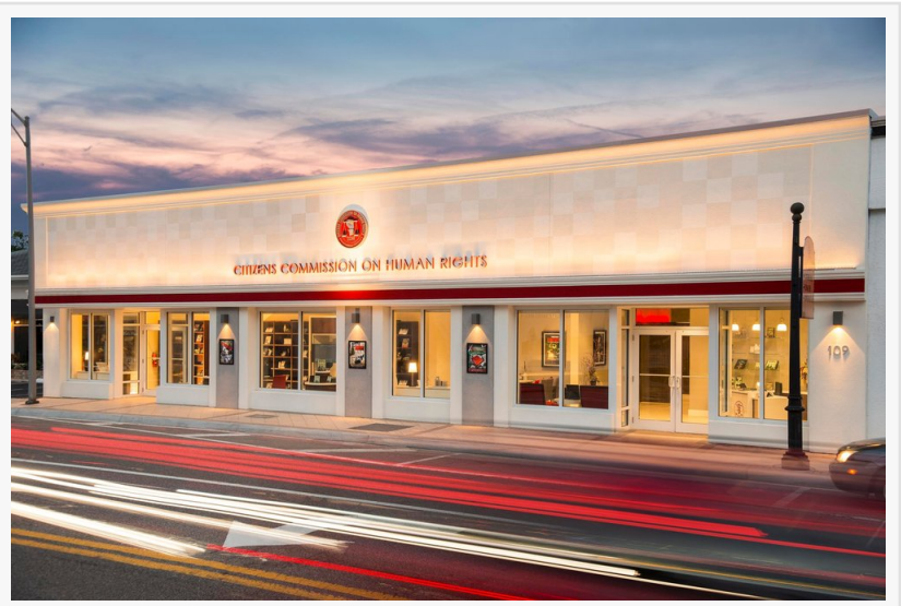
The headquarters for CCHR Florida are located in downtown Clearwater.

As stated by the United States Supreme Court, "The history and