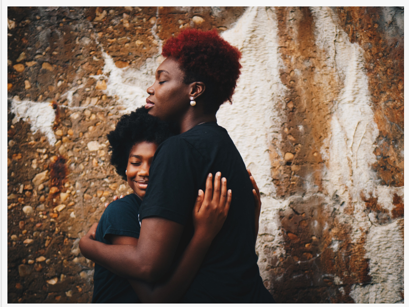
The interest of parents in the care, custody, and control of their children is recognized as a fundamental liberty protected by the Due Process Clause of the Fourteenth Amendment to the United States Constitution.