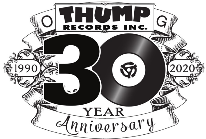
Thump Records Logo

This press release can be viewed online at: https://www.einpresswire.com/article/521248557