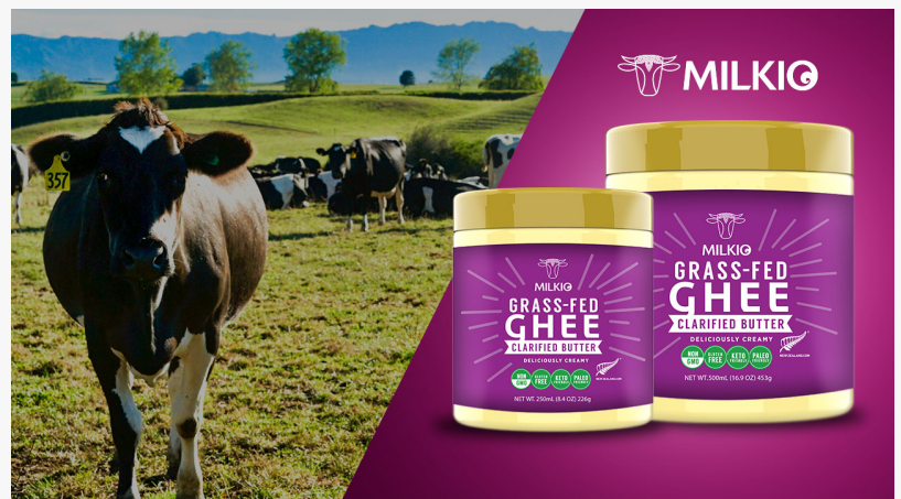
Ghee contract manufacturing