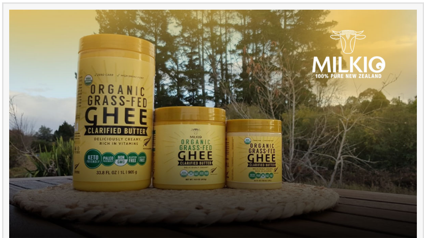
100% organic grass fed ghee (Clarified butter)

Milkio Foods Milkio Foods Limited +64 22 527 2571