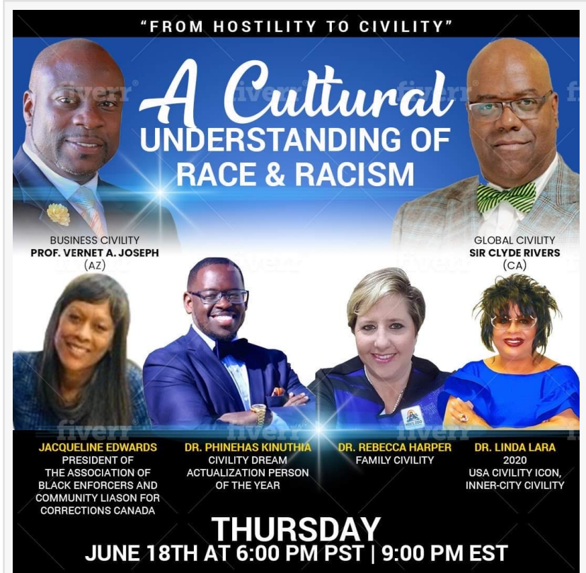
Speakers And Panelist For The 2020 Civility 360 Hostility to Civility Town Hall Meeting

Civility360 Town Hall Meeting (C360) is the leading voice of civility in action which focuses on