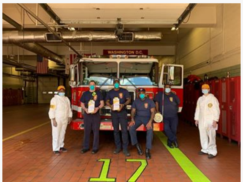
Church volunteers in PPE delivering Stay Well booklets to a fire station

To help local governments and others spread the message further about how to properly maintain personal hygiene and social distancing, the Church of Scientology International launched its online resource center at www.scientology.org/staywell in 20 languages. The materials are tools for effective prevention against the coronavirus and can be downloaded and shared for free.