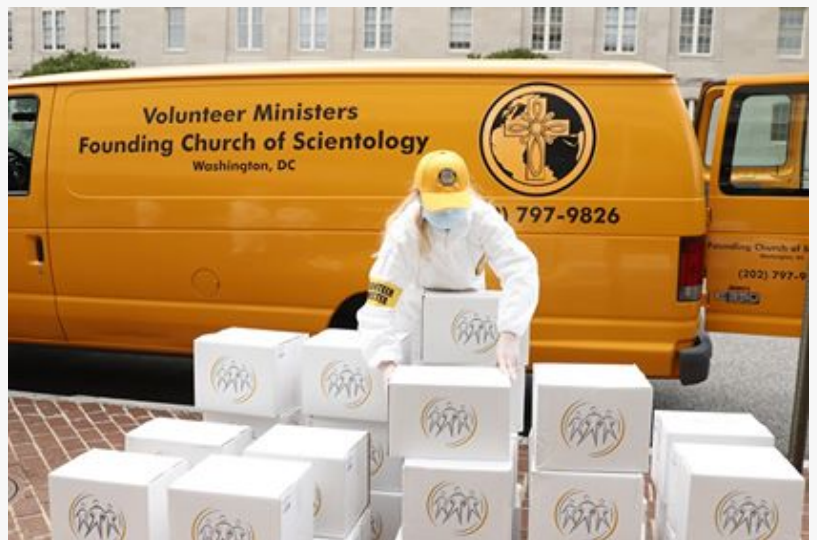
Several thousand Stay Well booklets being distributed by Church of Scientology volunteer