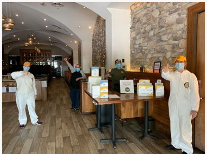
Stay Well booklets displayed at restaurant for distribution to their patrons