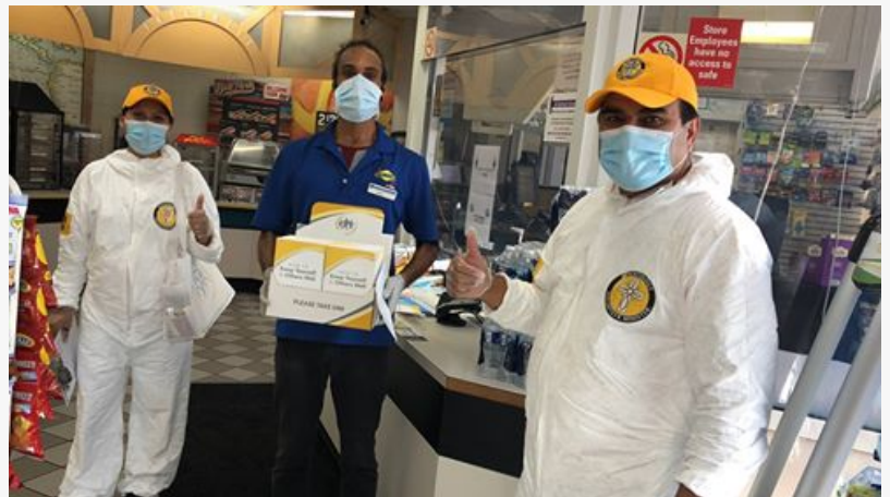
Convenience store owner receives Stay Well booklets

This press release can be viewed online at: https://www.einpresswire.com/article/521278816 EIN Presswire's priority is source transparency. We do not allow opaque clients, and our editors try to be careful about weeding out false and misleading content. As a user, if you see something we have missed, please do bring it to our attention. Your help is welcome. EIN Presswire, Everyone's Internet News Presswire™, tries to define some of the boundaries that are reasonable in today's world. Please see our Editorial Guidelines for more information. © 1995-2020 IPD Group, Inc. All Right Reserved.