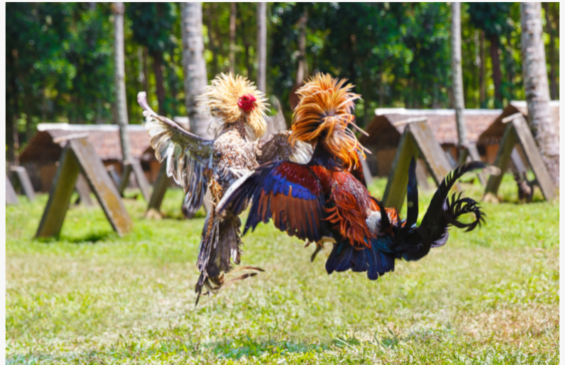
Cockfighting that runs rampant in Tennessee

NASHVILLE , TENNESSEE , USA, July 9, 2020 /EINPresswire.com/ -- The Animal Wellness Foundation (AWF) and Animal Wellness Action (AWA) today announced a $5,000 reward for information resulting in the successful prosecution of any individual for violating the federal law (7 U.S.C. § 2156) against animal fighting. The announcement follows the groups' release of an extensive cockfighting investigation in the Volunteer State and formal request to the U.S. Attorneys for the Eastern and Middle districts to investigate trafficking of fighting animals from Tennessee to U.S. territories and to foreign countries.