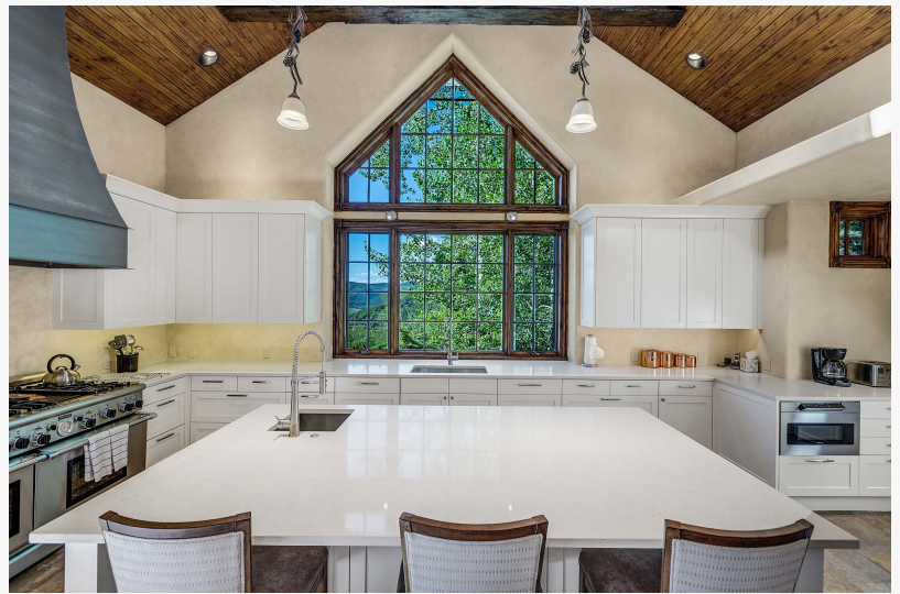
440 Spruce Ridge Lane