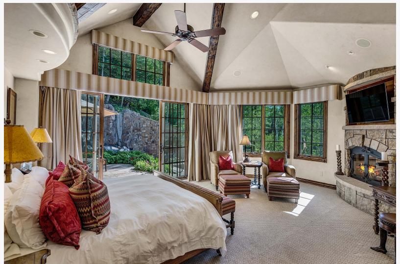
440 Spruce Ridge Lane

world-class mountain biking, world-class golfing, whitewater rafting, and fly-fishing on the