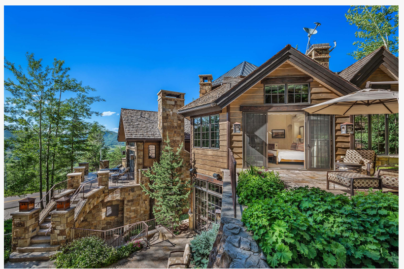
440 Spruce Ridge Lane