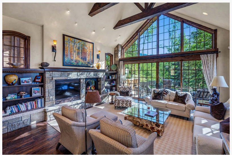
440 Spruce Ridge Lane

Known to be a premier skiing and snowboard destination, Snowmass Base Village is just minutes away and easily accessible from the property. With close proximity to Buttermilk, Aspen, Aspen Highlands, and Snowmass ski resorts, 440 Spruce Ridge Lane is ideal estate for winter adventure-seekers of all skill levels. When the summer sun hits, adventure can be found around every corner with world-class mountain biking, world-class golfing, whitewater rafting, and fly-fishing on the