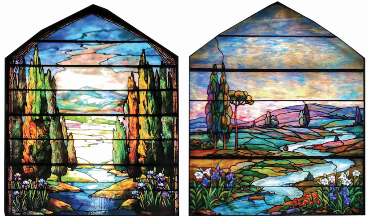
Two leaded-glass windows attributed to Tiffany Studios, formerly in a Philadelphia residence. Estimate: $100,000-$250,000