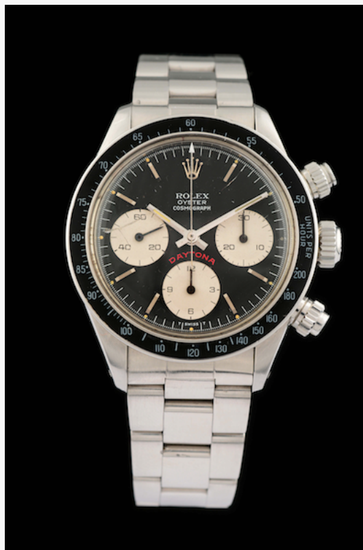
Men's stainless steel Rolex Oyster Cosmograph Floating 'Big Red' Daytona with Oyster bracelet, Ref. 6263, circa 1978, with box. Estimate: $100,000-$150,000

A stunning collection of Webb cameo glass perfume bottles includes floral motifs in a wide range of colors, miniature and smaller-size bottles, and desirable avian-form figurals. Among those "feathered" friends are a light blue swan with dark blue beak, $6,000-$8,000; and three falcons: dark ruby to lighter red with a yellow beak, $2,000-$4,000; ruby with gold-painted ferns and dot