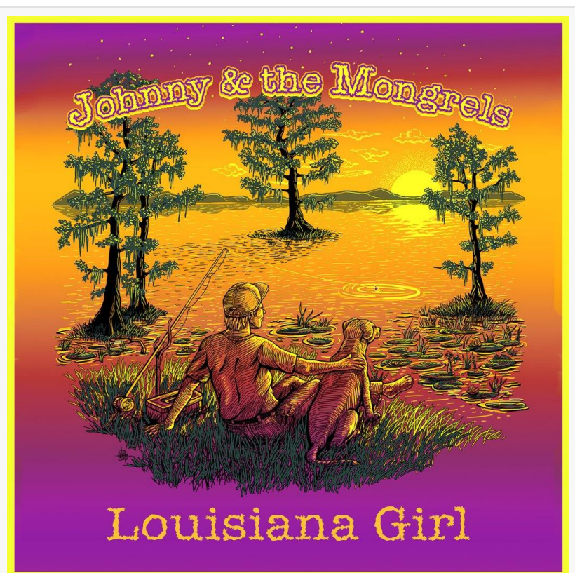
Louisiana Girl Single Cover