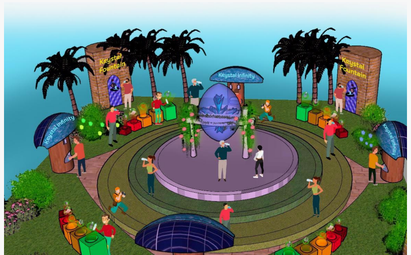
Krystal Grid Water complex commercial