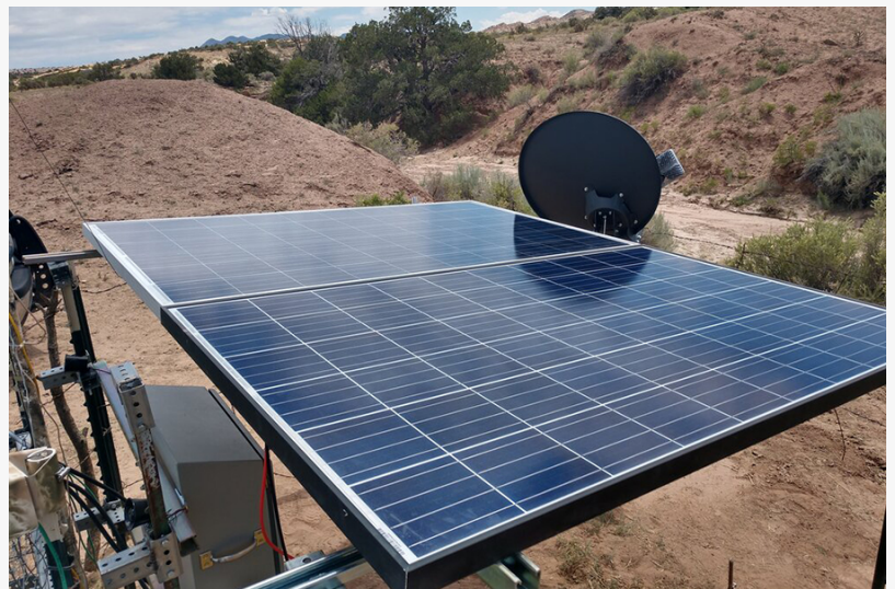
Solar power and satellites provide 24/7 operability