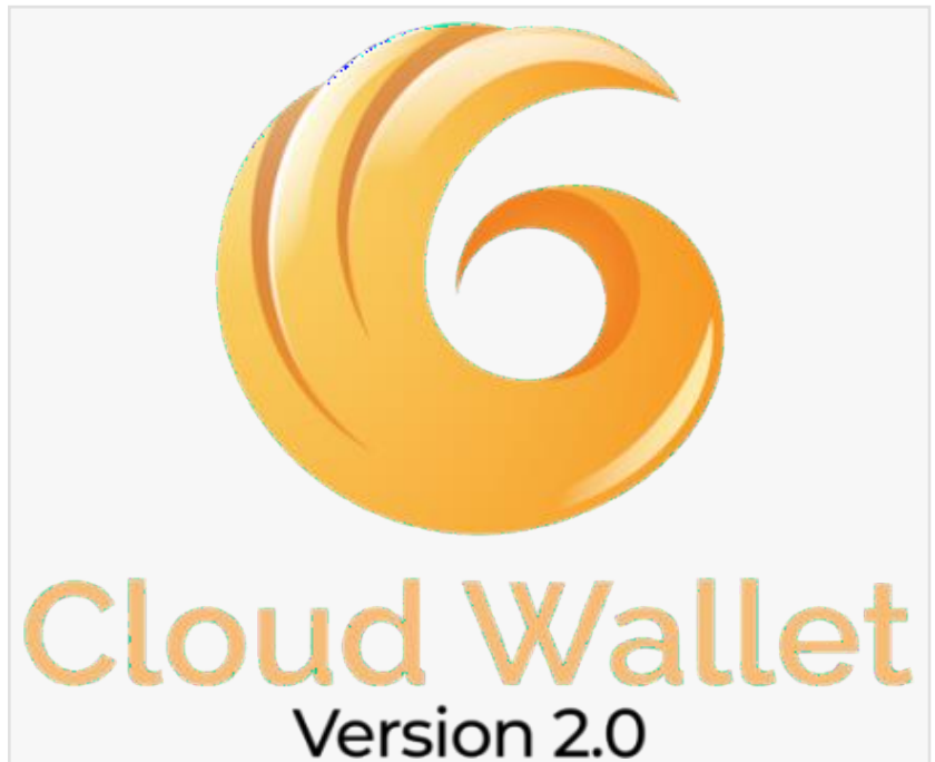
The Ronald Aai and Cloud 2.0

But now it is something we can't live without, and we can't even imagine life without it. The same is true of airplanes, radio, telephones, televisions, mobile phones, internet and wireless internet. In recent history, Microsoft, Apple, Google, Amazon and Facebook have used all the modern tools available to them at the time, and then by creative inventions of their own, launched the world into new