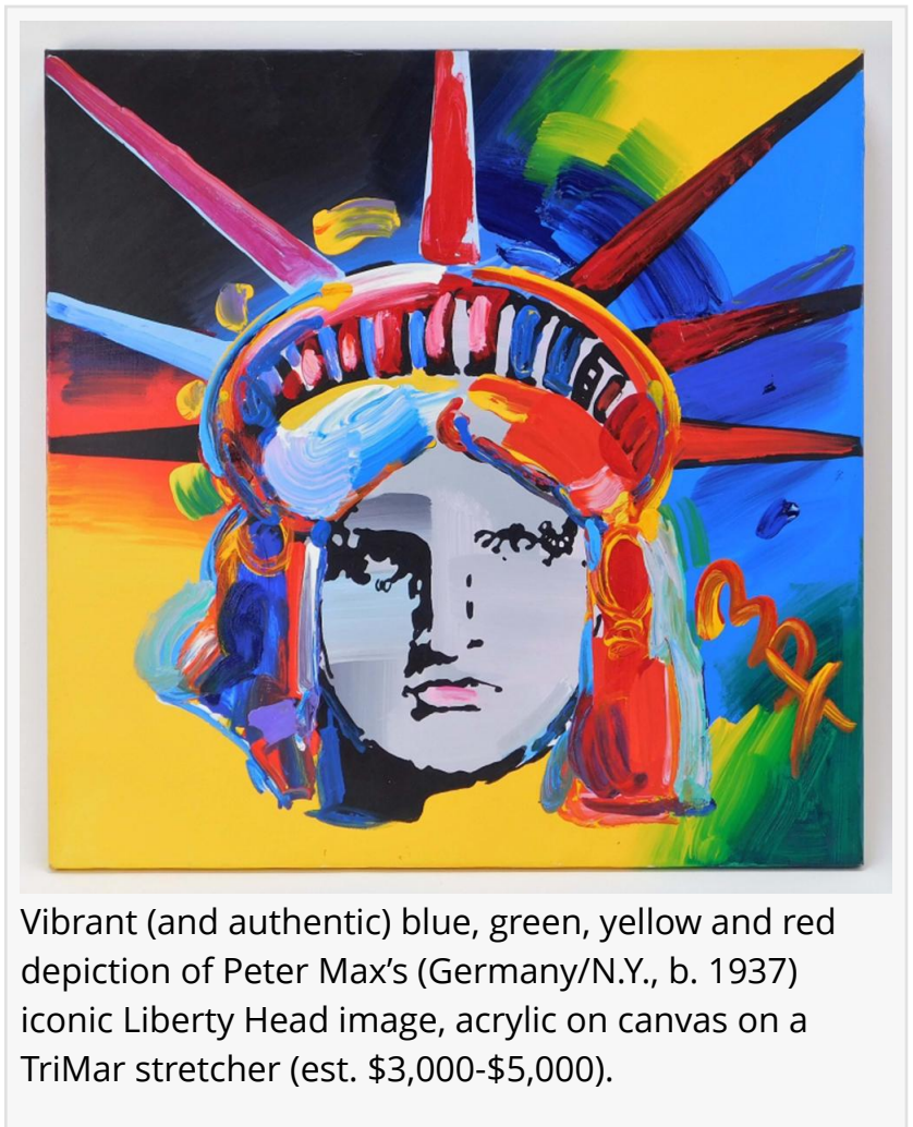
Vibrant (and authentic) blue, green, yellow and red depiction of Peter Max's (Germany/N.Y., b. 1937) iconic Liberty Head image, acrylic on canvas on a TriMar stretcher (est. $3,000-$5,000).

Other noteworthy lots include a circa 1900 antique Persian Bidjar Oriental wool carpet rug, 18 feet 7 inches by 11 feet 11 inches, having a royal blue center decorated with a floral vine pattern within layered floral borders (est. $1,500-$2,500); and a GV-1 Lancaster Glass pictorial pint railroad flask, grey-blue in color and embossed "Success to the Railroad" on both sides and a decoration of a train, 6 ¼ inches tall, with great color and mold impression (est. $600-$900).