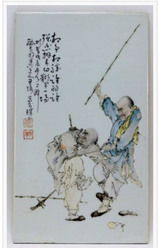
Chinese Qing Dynasty famille rose plaque, exceptionally well painted, depicting two figures with a calligraphic poem and signatures, 17 ½ inches by 10 ¼ inches (est. 2,000-$4,000).

This press release can be viewed online at: https://www.einpresswire.com/article/521413493