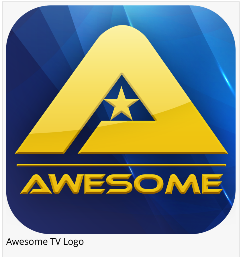
Awesome TV Logo