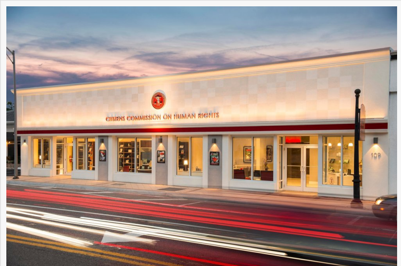
The headquarters for CCHR Florida are located in downtown Clearwater.