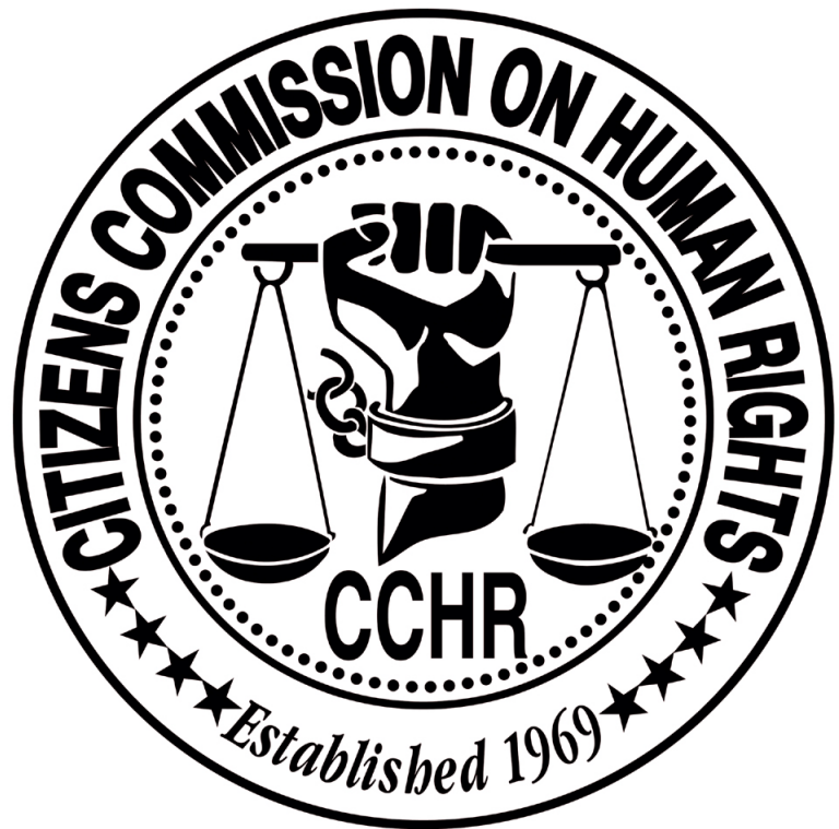
The Citizens Commission on Human Rights is a non-profit mental health watchdog dedicated to the eradication of abuses committed under the guise of mental health.