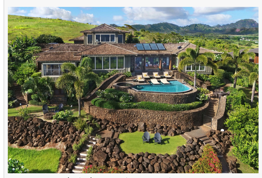
5741 Ka Hookui Place, Poipu, Kauai, HI