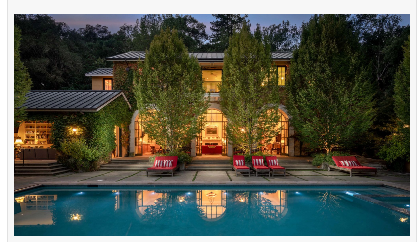
18730 Canyon Road, Sonoma, CA