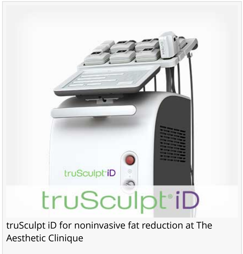
truSculpt iD for noninvasive fat reduction at The Aesthetic Clinique

SANTA ROSA BEACH, FLORIDA, USA, July 19, 2020 /EINPresswire.com/ -- The Aesthetic Clinique has long been known for having all the latest technologies for cosmetic enhancements. The truSculpt iD was added recently to our body contouring treatments which consists of Coolsculpting and Emsculpt . All 3 treatments are noninvasive and when combined, work synergistically to reduce unwanted fat deposits and to tone muscle groups. There is no downtime with these procedures and most areas of the body can be targeted with the variety of applicators available at The Aesthetic Clinique.