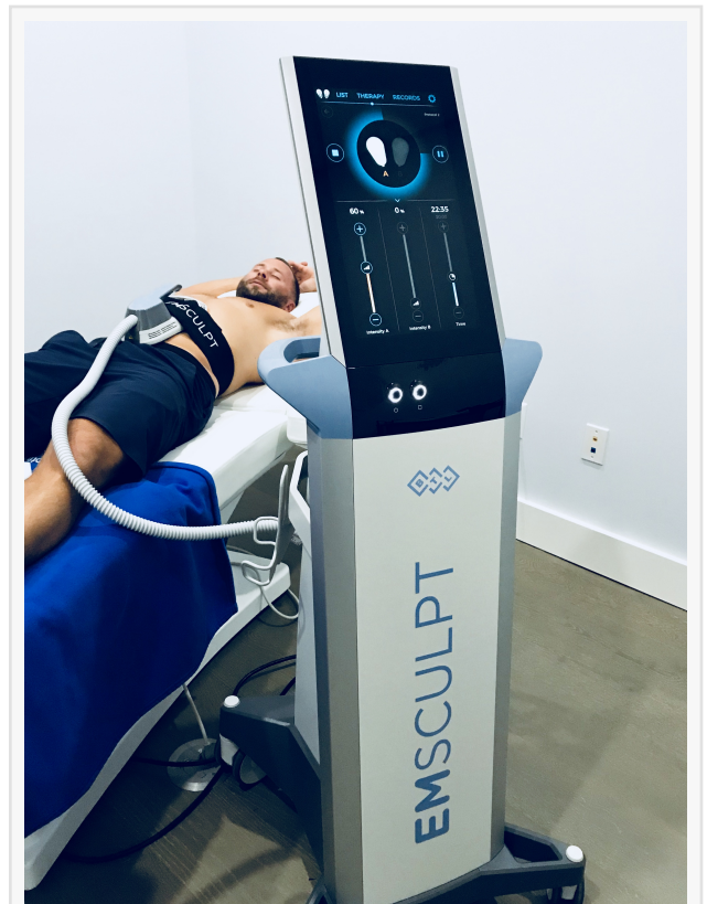
Emsculpt is Used to Strengthen Abdomen and Core Muscles - Aesthetic Clinique

This press release can be viewed online at: https://www.einpresswire.com/article/522054968