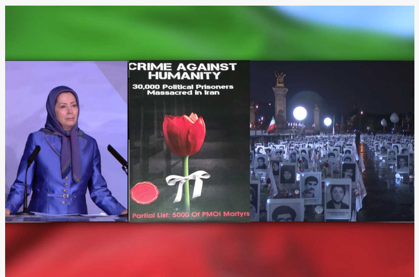
Ashraf 3 – Albania, Maryam Rajavi: Call for justice to hold the Iranian regime to account

Held at Ashraf3, the event was attended by Maryam Rajavi, the NCRI President-elect. Several international lawyers and political figures, as well as several MEK members, who had served time in the mullahs' prisons and witnessed the massacre, spoke at the gathering.