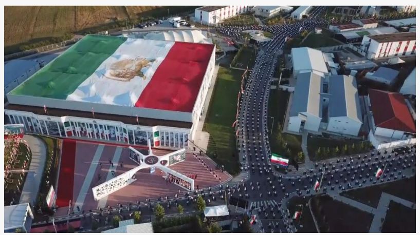
Ashraf 3 – Albania: Commemorating the 32nd anniversary of the 1988 massacre of the political prisoners

to destroy this alternative, which is what needs to exist. It has been seeking to convince the world that there is no alternative to this regime and that the world must get along with the mullahs. And when it failed to destroy the PMOI/MEK and the National Council of Resistance of Iran (NCRI), it claims that the PMOI/MEK and the NCRI are worse than the regime and, therefore,