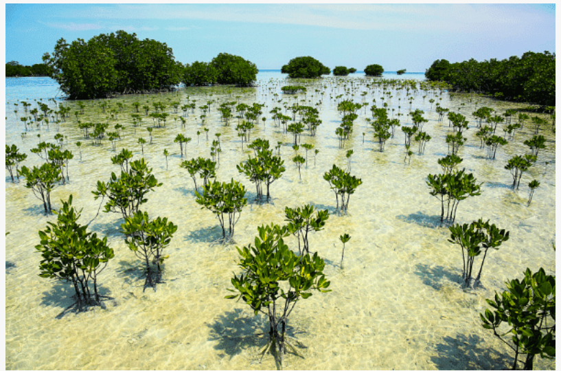
e-cigarette brand SMOKO helping to plant a mangrove in Madagascar