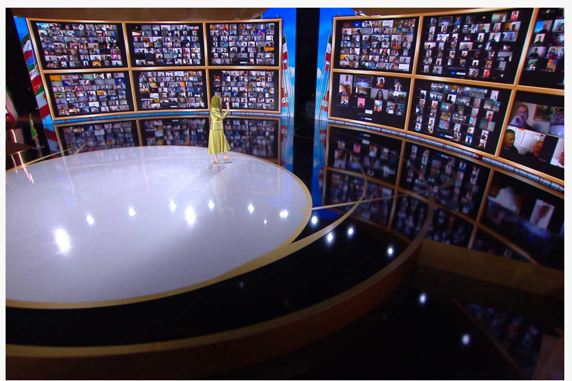
Third Day of the Free Iran Global Summit

the regime's hands by acknowledging that its terrorism is a sign of its power and strength. However, there has always been a direct link between the escalation of uprisings and intensification of the regime's social and economic challenges on the one hand, and its resort to terrorism on the other. In fact, it was not the power of the regime that made the expansion of its