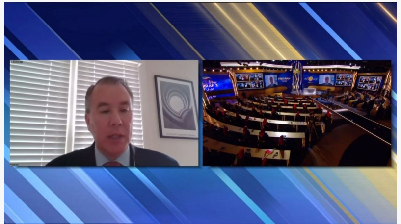
Former U.S. Under Secretary of Defense for Policy John Rood