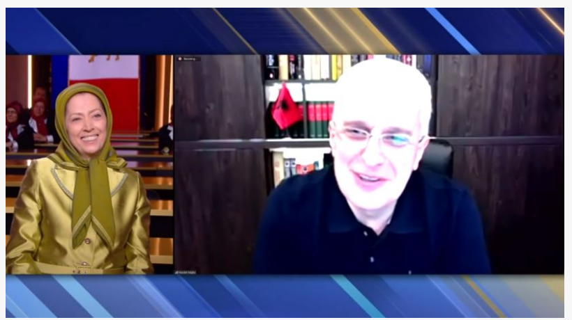
Former Albanian Prime Minister Pandeli Majko

Other speakers of this event included Mayor Giuliani, former Homeland Security Secretary Tom Ridge, Pandeli Majko former Prime Minister of Albania, former U.S. Under Secretary of Defense for Policy John Rood, former Undersecretary of State for Arms Control and International Security Robert Joseph, Senator Robert