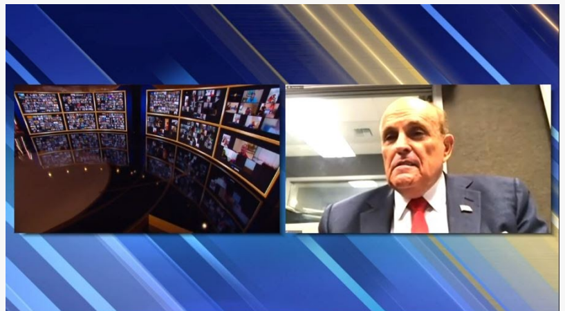
Former New York Mayor Rudy Giuliani