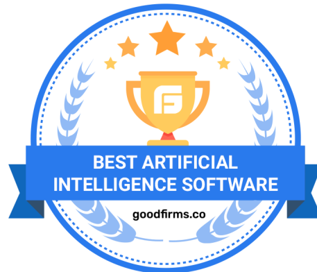
Best Artificial Intelligence Software

Intelligence has become the guiding light to empower businesses to transform themselves into smart businesses towards better tomorrow. AI systems are being used by most of the companies to get their tasks done efficiently and on time. But as there are numerous AI tools in the market, it is challenging for the service seekers to pick the best one. Therefore, GoodFirms has curated the list of Best Artificial Intelligence Software recognized to deliver optimal solutions.