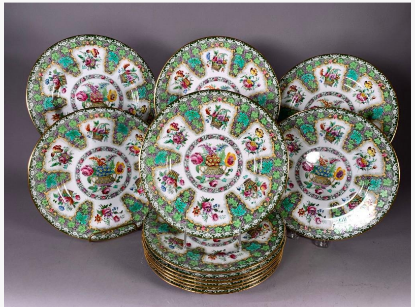
Set of twelve Spode Copeland dinner plates, decorated with floral baskets filled with colorful glazes against a green and white border (est. $400-$600). Each plate is 10 ¼ inches in diameter.

BEACHWOOD, OH, UNITED STATES, July 21, 2020 /EINPresswire.com/ -- Neue Auctions' online-only Summer Art & Antiques Auction is coming up quick – this Saturday, July 25th, at 10 am Eastern time. The sale is packed with 300 lots of unique treasures seeking new homes. These include art , antiques , rock 'n' roll-signed albums, vintage posters , decorative arts, Asian objects, furniture garden items, works on paper and more.