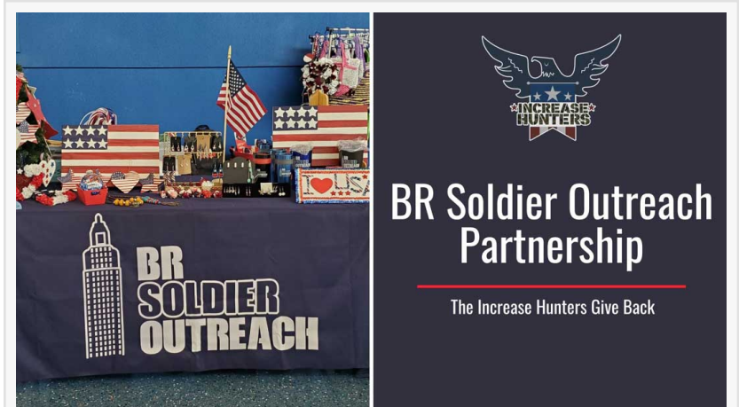
The Increase Hunters - BR Soldier Outreach Partnership

We are very proud that 100% of the shop's proceeds are going straight to the BR Soldier Outreach Program!