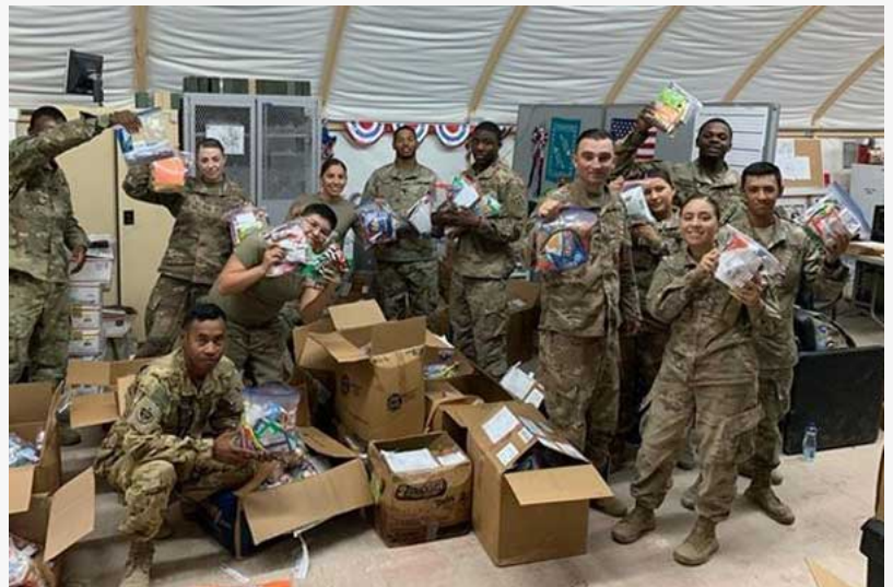
Soldiers with Care Packages from BR Soldier Outreach