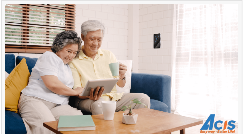
Smart home technology makes it easy for people to manage their homes

According to the development trend of technology, A smart home is expected to be a new breeze for families in Vietnam. However, during the first stage, people only see the smart home system in resorts, luxury hotels, and villas. There are three main reasons why the smart home has not to grow up: