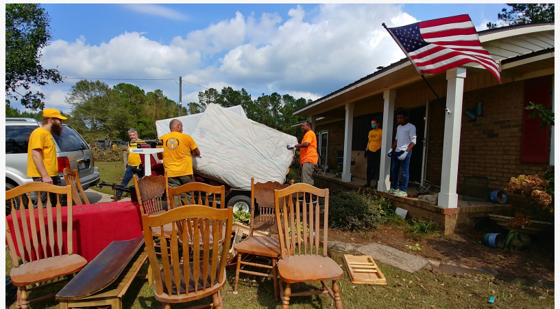
Salvaging personal property following a hurricane