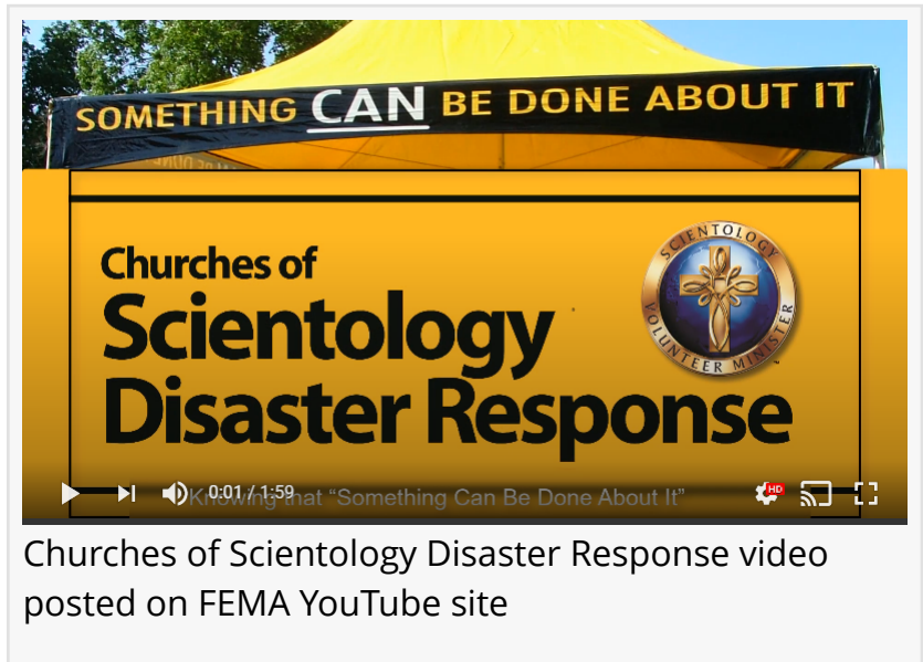
Churches of Scientology Disaster Response video posted on FEMA YouTube site

WASHINGTON, DC, USA, July 23, 2020 /EINPresswire.com/ -- Each year US communities are devastated by hundreds of disasters, large and small, ranging from hurricanes and tornadoes to earthquakes, floods and mudslides. All disaster responses start out locally but many progress to a statewide or national level response involving many faith-based and other organizations dedicated to helping those in need.