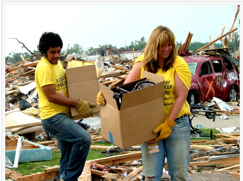
Volunteer Ministers doing clean up following a tornado