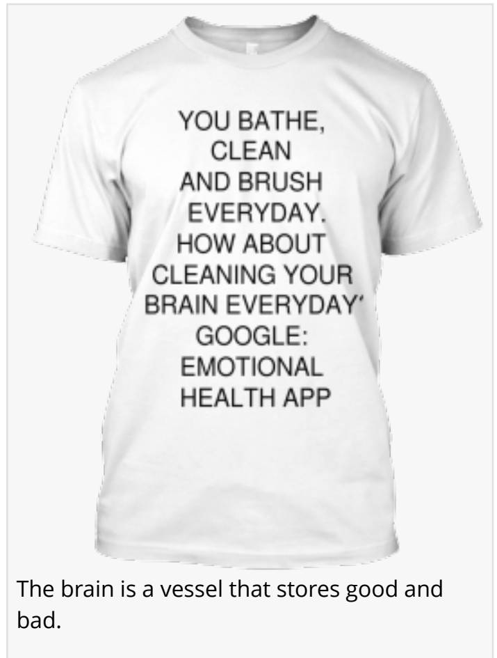
The brain is a vessel that stores good and bad.

I have challenged Oprah and the experts that they are promoting half-baked knowledge but do