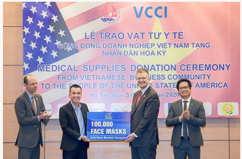
Dony Garment Company along with other Vietnamese enterprises donated medical supplies to the US