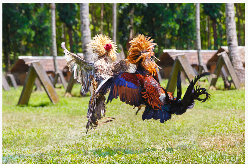
Cockfighting that runs rampant in Alabama

“I’m pleased this provision will force the Bureau of Land Management to move away from cruel and costly helicopter roundups toward humane management of these national symbols of our wild lands,” said U.S. Rep. Steve Cohen (D-TN). “It requires the Bureau of Land Management to utilize $11 million of its Wild Horse and Burro Program budget to implement PZP -- a humane and reversible fertility control vaccine to manage wild horse populations.”