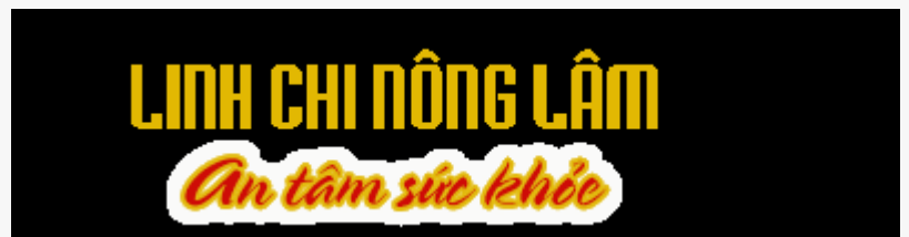
Slogan Linh Chi Nong Lam: An Tâm Sức Khỏe (Peace of mind)