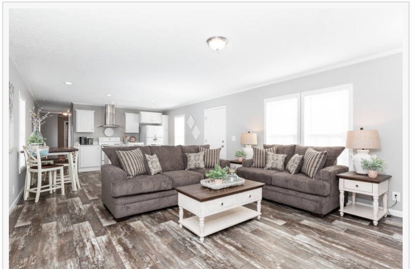
Design and Custom Order Your New Home at The Meadows

This press release can be viewed online at: https://www.einpresswire.com/article/522622503