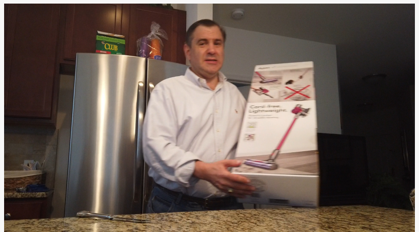
Dyson V7 Motor Head

FRANKLIN LAKES, NJ, USA, July 27, 2020 /EINPresswire.com/ -- The United States, For Immediate Release –