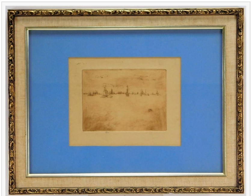
Impressionist etching by James Abbott McNeill Whistler (Mass./U.K./France, 1834-1903), of sailing vessels at sea, 5 inches by 6 ¾ inches and signed in pencil lower margin ($7,500).

Following are additional highlights from the auction. Internet bidding was facilitated by LiveAuctioneers.com, Invaluable.com, Bidsquare.com and bidLIVE.Bruneauandco.com, plus the mobile app “Bruneau & Co.” on iTunes and GooglePlay. Phone and absentee bids were also taken. All prices quoted include the buyer’s premium.