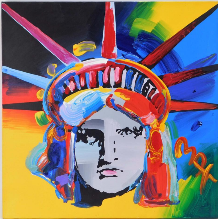
Vibrant (and authentic) blue, green, yellow and red depiction of Peter Max's (Germany/N.Y., b. 1937) iconic Liberty Head image, acrylic on canvas on a TriMar stretcher, signed ($5,625).