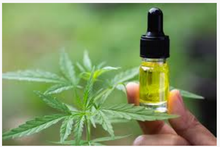
CBD Oil Marketing Lists

Changing With The American Marketplace Sprint Data Solutions Worldwide Marketing is a wholly American owned and operated