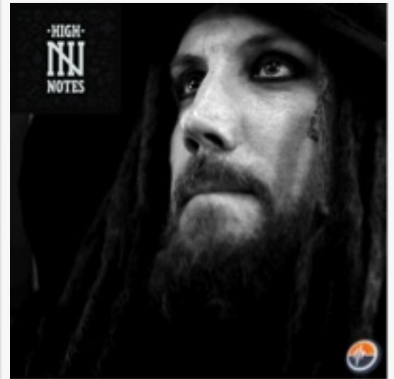
Brian "Head" Welch of KoRn