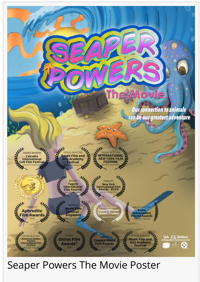
Seaper Powers The Movie Poster