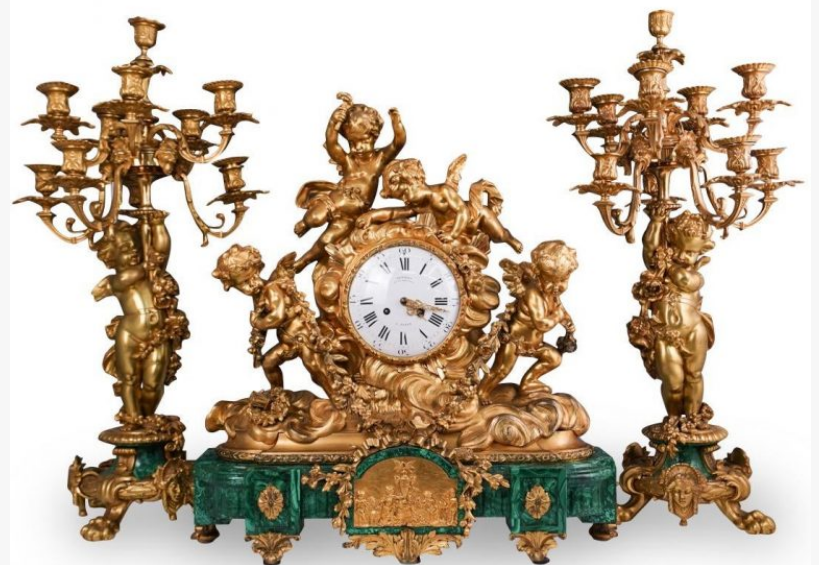
(3 Pc) 19th Cent. French Bronze and Malachite Clock Set