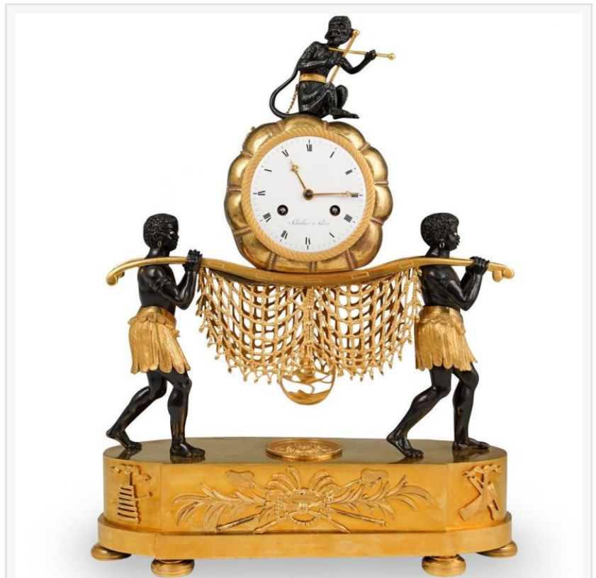
Rare 19th Cent French Empire Gilt Bronze Mantel Clock

The Estates Worldwide sale might also attract Ernest Trova collectors. Table Man, offered in the sale, is a variant of Trova's Falling Man series, which he called "man at his most imperfect." It is a stainless-steel sculpture by the American artist with an estimate of $10,000 to $15,000. Executed in 1979, this piece comes from an edition of