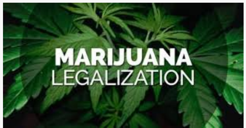
Marijuana E Mail Marketing Lists

Within the United States itself, different states are at various stages of the legalization process and taking different approaches to it. Some states, for example, are currently only offering