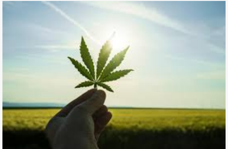
Marijuana Smokers - Turnkey Direct Mail Campaigns

The Market Is About Change Sprint Data Solutions Worldwide Marketing is an entirely American owned and operated business that was founded by a disabled veteran. After protecting the country to make it safer, the next step was to put that safety and stability to use, giving the business community of the country that chance it needed to grow even further and help the economy. Sprint Data Solutions Worldwide Marketing now has a staff with a combined total of over 50 years of marketing experience ready to help clients.