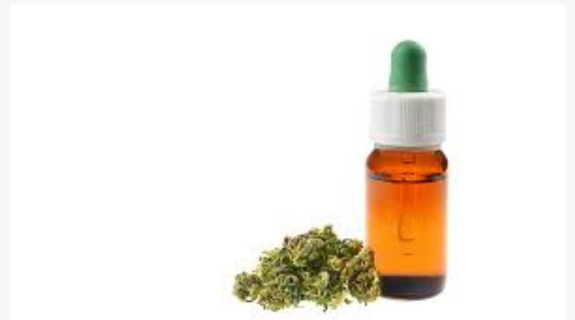
Marijuana Radius Email Campaigns, SMS or Direct Mail