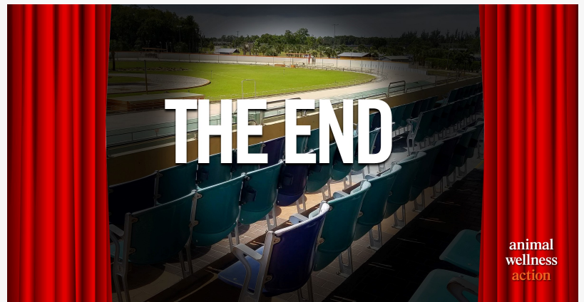
Greyhound Protection Act

During the course of an investigation that spanned nearly a year, greyhound protection group GREY2K USA documented illegal greyhound training at breeding farms in three states, including